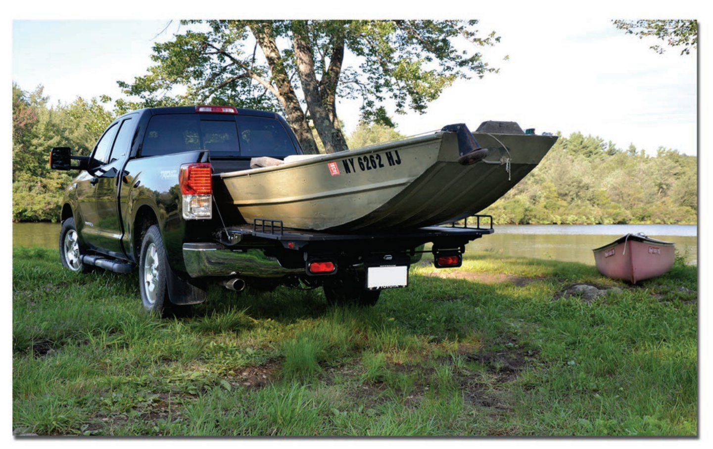
We Haven't Forgotten About Boats